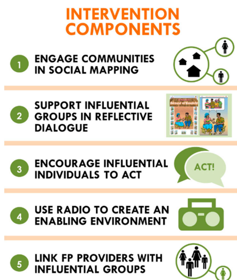
Figure 1. Package of social network interventions.

In response, Tékponon Jikuagou is testing a package of community-based social network activities (Figure 1) in Couffo Department, Benin, to reduce social barriers that prevent women and men from addressing unmet need. On an individual level, the intervention aims to increase the acceptability of discussions about fertility desires and family