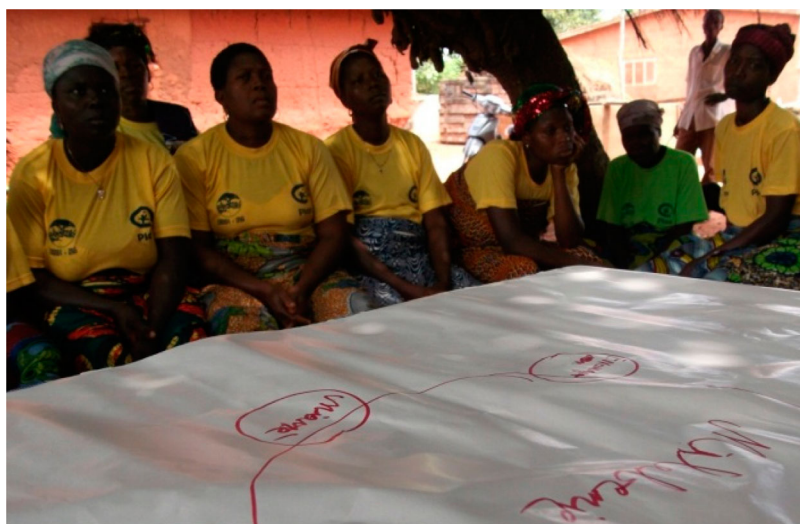
Figure 4. Meeting with an influential women's group to validate connectivity and influence through Venn diagramming (Step 5).

Analysis of the reports prepared after each mapping exercise and notes from staff learning reflection discussions indicate that communities were engaged in creating and discussing their visual outputs and there was equitable participation in network analysis discussions by women, men, and youth. People stayed until the end of the exercises. Large numbers of people chose to participate, generally ranging from 15 to 30 people. These reports also indicated that child spacing and family planning were of great interest, indicating the methodology was sufficiently sensitive to avoid controversy in a context with widespread family planning stigma. Staff comments from several mapping reports, below, reflect consistent patterns across villages: