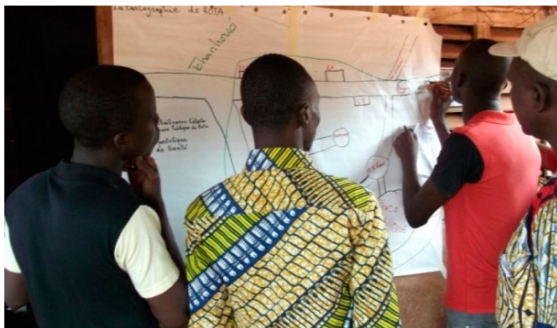
Figure 3. Representative men's group creating a social map and identifying influential individuals (Step 3).

Analysis of the reports prepared after each mapping exercise and notes from staff learning reflection discussions indicate that communities were engaged in creating and discussing their visual outputs and there was equitable participation in network analysis discussions by women, men, and youth. People stayed until the end of the exercises. Large numbers of people chose to participate, generally ranging from 15 to 30 people. These reports also indicated that child spacing and family planning were of great interest, indicating the methodology was sufficiently sensitive to avoid controversy in a context with widespread family planning stigma. Staff comments from several mapping reports, below, reflect consistent patterns across villages: