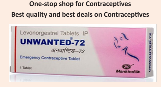
Figure 1. EC as advertised online in India

This case study presents current trends, potential advantages, and challenges related to the use of e-commerce for the distribution of emergency contraception (EC). EC is an important "second-chance" method widely available around the world. It is generally available without a prescription, but some forms of the medication still require one in some countries. This research confirmed that EC can be purchased online in a number of European, North American, and South American countries, as well as in some Asian countries; there was no evidence of online access in Africa. Currently EC is sold online through several mechanisms, including e-commerce marketplaces (such as Amazon.com) and pharmacy chains that sell medical products online. In addition, a global reproductive health (RH) advocacy organization, a U.S.-based clinic network, and specialized online vendors in the U.S. are selling EC online. For various reasons, EC is not available online in some countries in Europe and elsewhere. Key challenges that emerged include the cost of the drugs and shipping, stigma (around online sales of medicines and RH supplies), and prescription requirements. In restricted environments where EC is not available through established channels, online access offers unique opportunities for women to access EC.