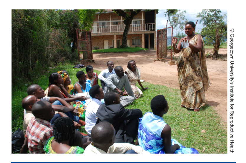
A trainer teaches a group of health care providers how to use CycleBeads, the color-coded string of beads used with the Standard Days Method of family planning.

(Democratic Republic of Congo, Guatemala, India [State of Jharkhand], and Mali) revealed the importance of the political and health policy environments; such factors are not typically identifiable via routine monitoring systems because they are often unexpected, imprecise, and come from a host of sources. Therefore, we collected data on environmental factors through other methods including: