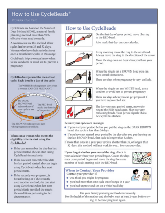
CycleBeads Cue Card